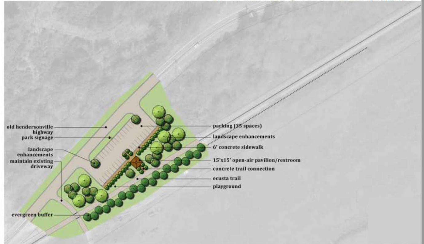
Figure 6.19- Potential Trailhead at Everett Road & Old Hendersonville Highway