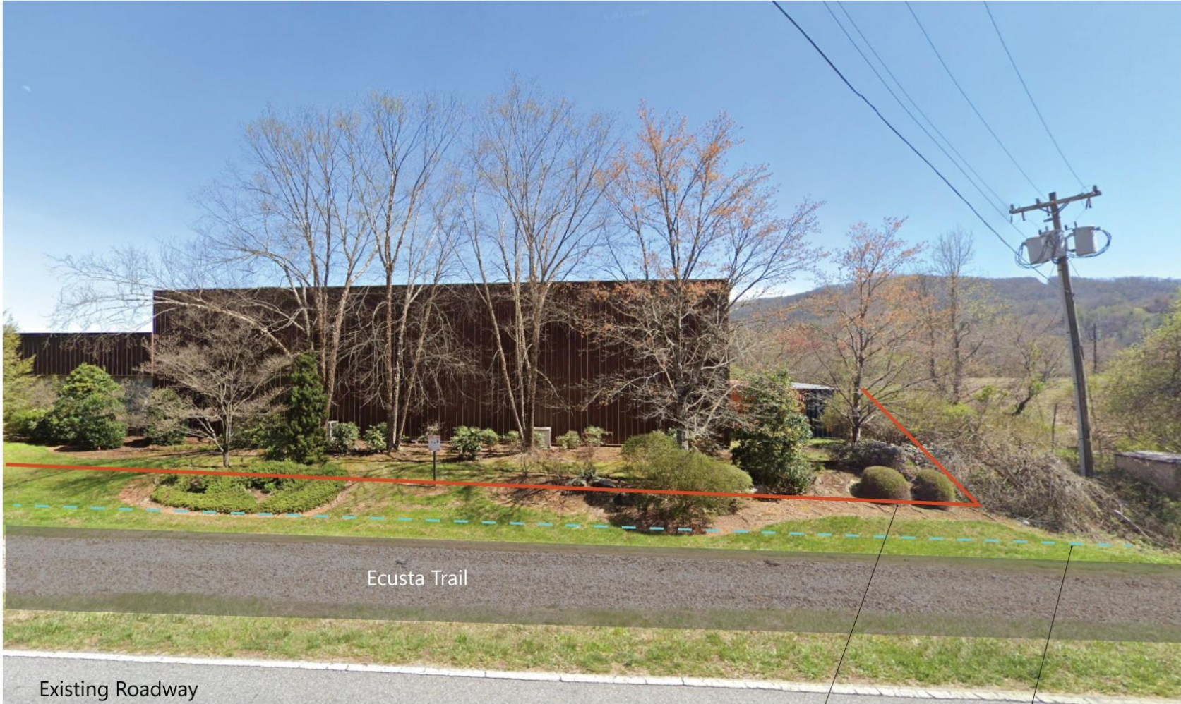
Proposed fenceline at top of slope

This will be worked out during the final design.